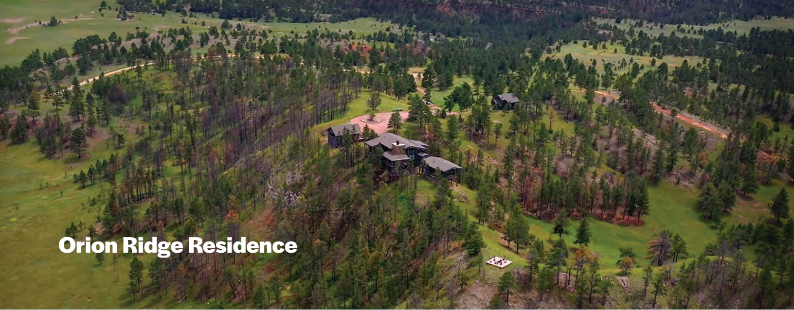
Orion Ridge Residence