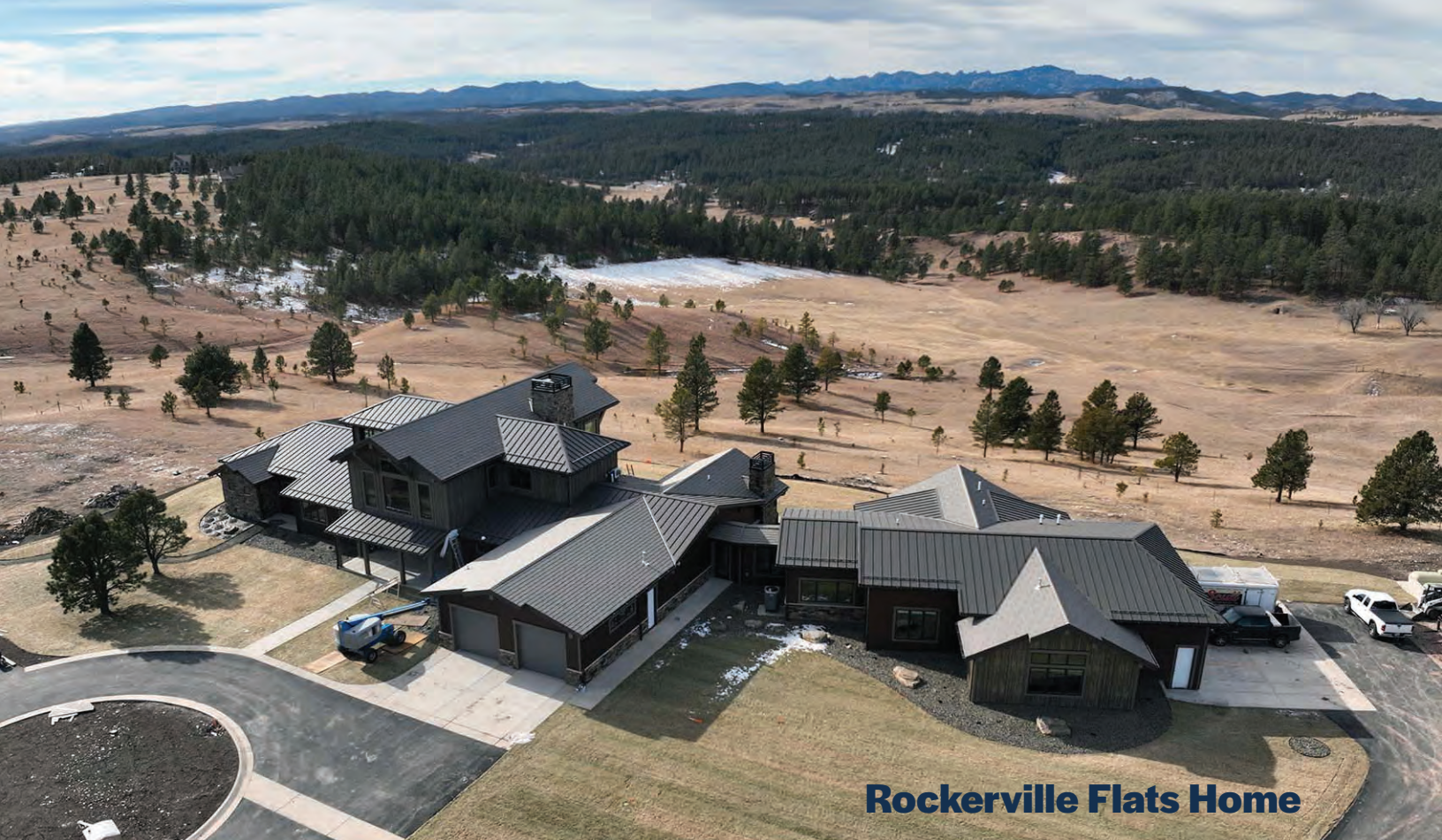
Rockerville Flats Home