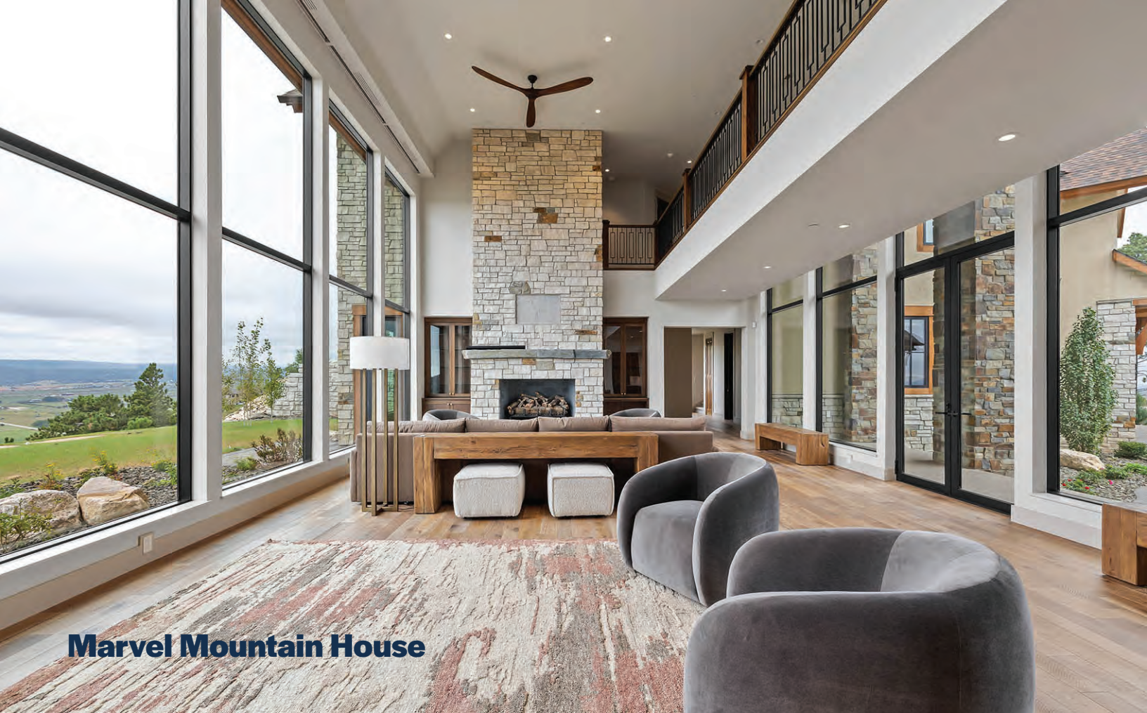
Marvel Mountain House