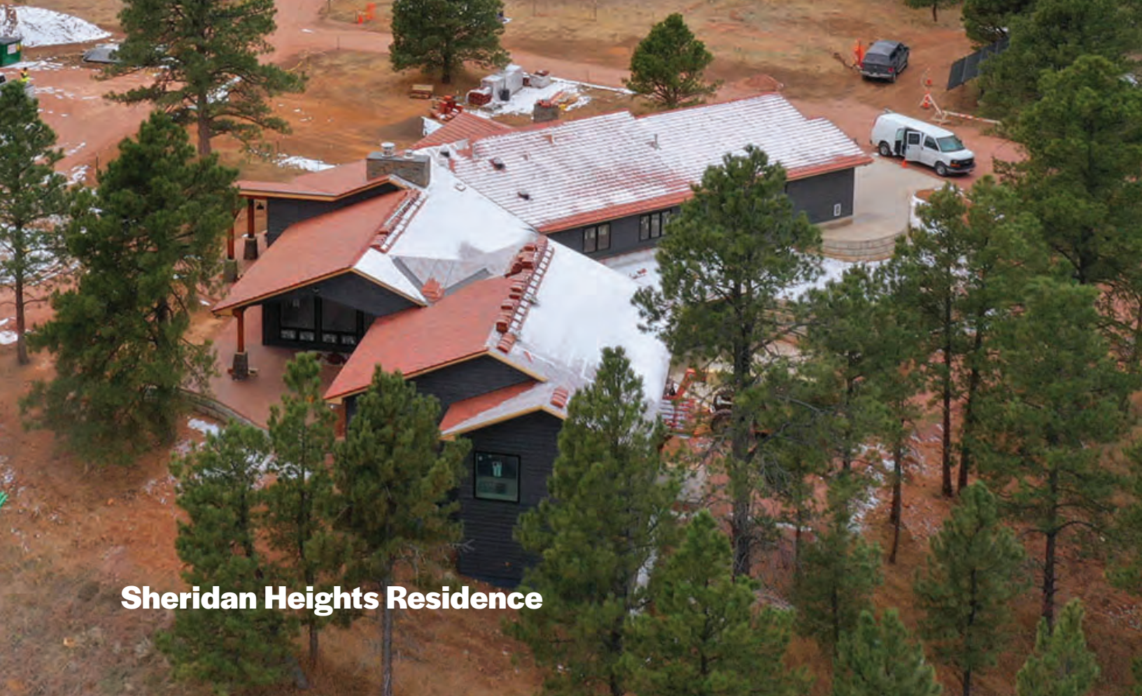
Sheridan Heights Residence